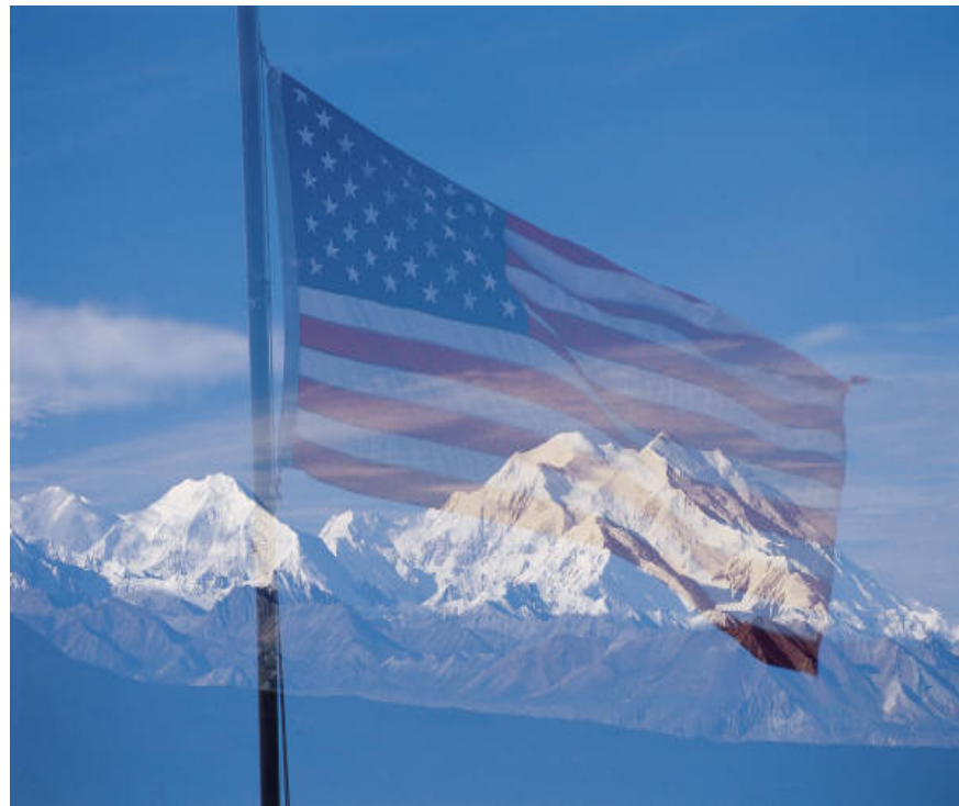
THE DREAM LIVES ON.....FREEDOM!

O beautiful for patriot dream That sees beyond the years Thine alabaster cities gleam Undimmed by human tears! America! America! God shed his grace on thee And crown thy good with brotherhood From sea to shining sea! (AUDIENCE, PLEASE STAND)